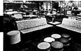
MIRROR LAKE ELEMENTARY