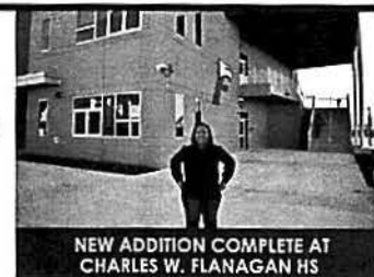
NEW ADDITION COMPLETE AT CHARLES W. FLANAGAN HS

10 SCHOOLS COMPLETED DESIGN 1 SCHOOL BEGAN CONSTRUCTION 1 SCHOOL COMPLETED CONSTRUCTION 2 SCHOOLS COMPLETED SCEP