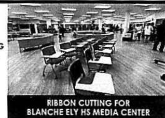
RIBBON CUTTING FOR BLANCHE ELY HS MEDIA CENTER

8 SCHOOLS COMPLETED DESIGN 11 SCHOOLS HIRED OR HIRING CONTRACTOR 8 SCHOOLS APPROVED FOR CONSTRUCTION 3 SCHOOLS COMPLETED SCEP