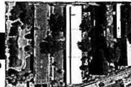
STRANAHAN HIGH SCHOOL