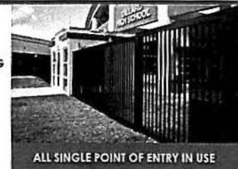
ALL SINGLE POINT OF ENTRY IN USE

20 SCHOOLS COMPLETED DESIGN 21 SCHOOLS HIRED OR HIRING CONTRACTOR 11 SCHOOLS APPROVED FOR CONSTRUCTION 9 SCHOOLS COMPLETED SCEP