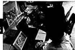
ANNABEL C. PERRY PRE K-8

● .... FY 20 Q1 REPORTING PERIOD JULY 1 - SEPT 30