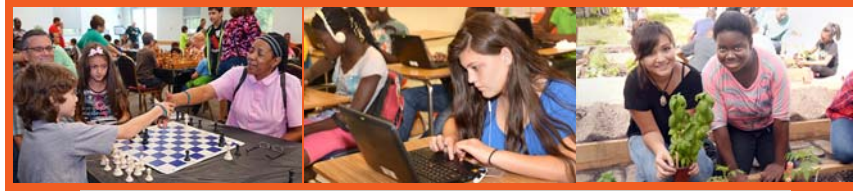
Head Start/Early Intervention